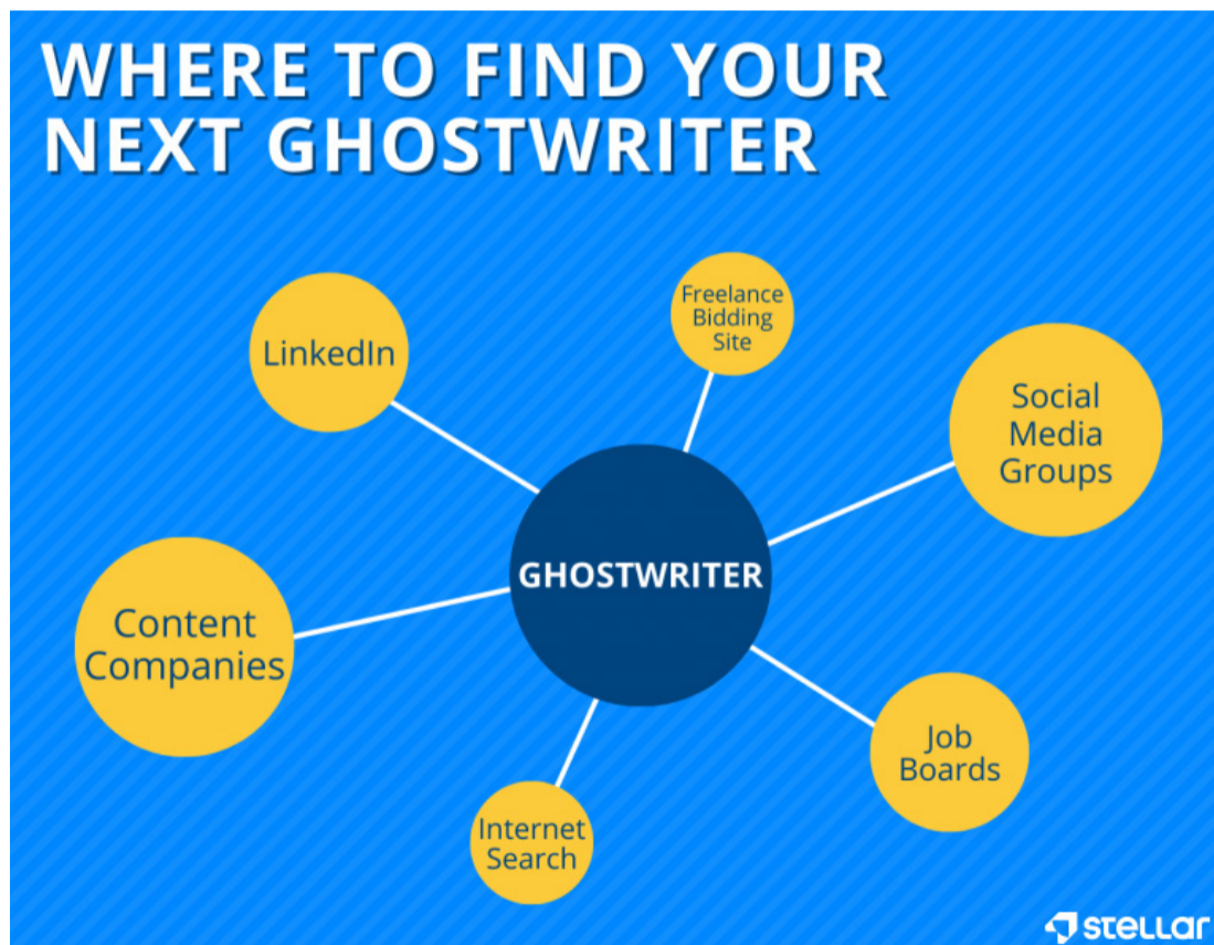
A diagram listing where you can find ghostwriters